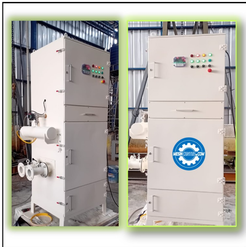
Mesin Center Movable Industrial Dust Collector.jpg